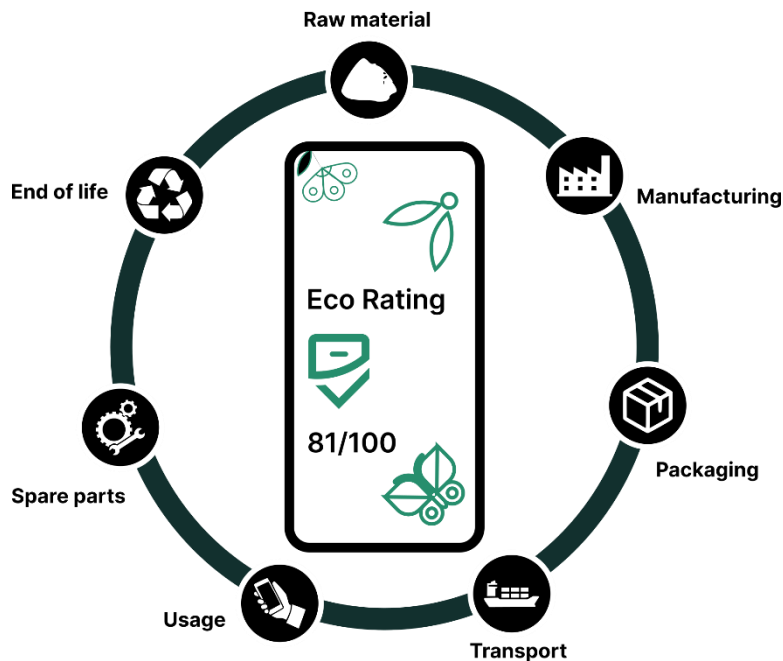
Figure 01.- Mobile phone life cycle

The Eco Rating method evaluates mobile phone devices from a life cycle perspective. The method allows the obtention of a final characteristic Eco Rating score, showing the environmental performance of the assessed device considering its whole life cycle.